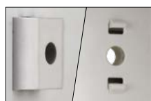
Spacers (plastic) – 8mm