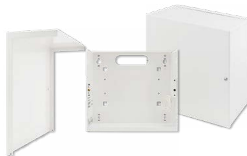
Sample product: AWO401

Metallic enclosures for batteries are designed as supplementary elements for Intrusion Detection Systems, Access Control systems, etc. Dedicated for surface mounting of maintenance-free lead-acid batteries of following capacities: 7Ah / 17Ah / 28Ah / 44Ah / 65Ah. In addition, when using PKAZ107, it is possible to mount enclosure on DIN rail (TH35) – only AWO401.