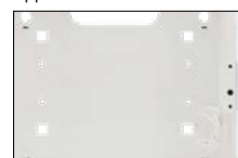
Holes for PKAZ107