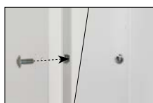
Closing – screwed – 2 pieces