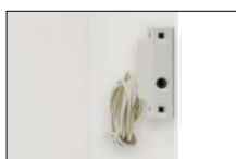
Tamper switch detecting enclosure opening – 1 piece